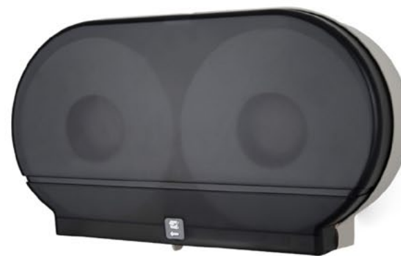
Model 27 Twin 9" Jumbo Roll Tissue Dispenser