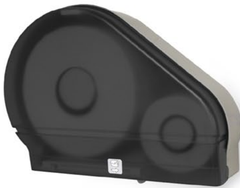
Model 24 Single 9" Jumbo Roll Tissue with Stub Roll