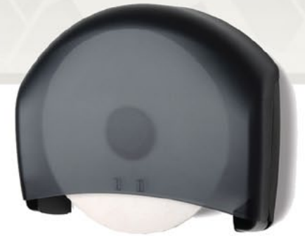
Model 29 Single 12" Jumbo Roll Tissue

Accommodates all Jumbo Roll Tissue widths The modular mandrel enables conversion to either one 12" roll or a 9" with stub roll with 3" cores Width 16.63" Height 14.44" Depth 5.00"