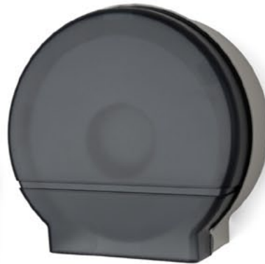
Model 26 Single 9" Jumbo Roll Tissue Dispenser