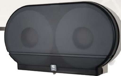
Model 27 Twin 9" Jumbo Roll Tissue Dispenser

Accommodates all brands of 9" Jumbo Roll Tissue with 3" cores Removable adaptor models available by special order for 2.25" to 3" cores Width 20.25" Height 11.75" Depth 5.38"