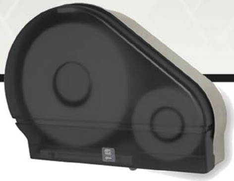
Model 24 Single 9" Jumbo Roll Tissue with Stub Roll

Accommodates all brands of 9" Jumbo Roll Tissue with 2.5" to 3" cores Comes with molded mandrels and removable adaptors to accommodate core sizes up to 3.375" Sliding panel ensures the use of only one roll at a time Width 16.25" Height 11.50" Depth 5.25"