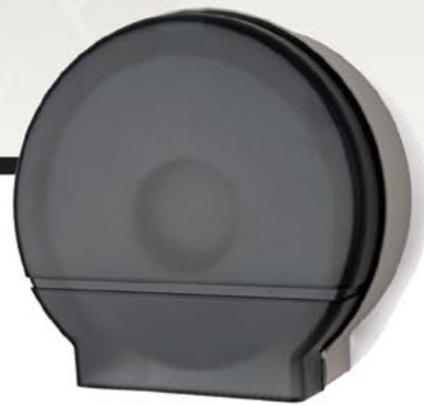
Model 26 Single 9" Jumbo Roll Tissue Dispenser

Accommodates all brands of 9" Jumbo Roll Tissue with 3" cores Removable adaptor models available by special order for 2.25" to 3" cores Width 11.38" Height 11.38" Depth 5.38"